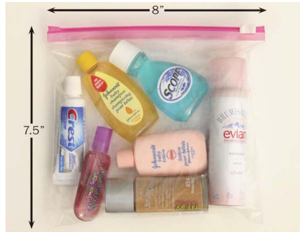
Sample zip-top bag for liquids in carry-on luggage